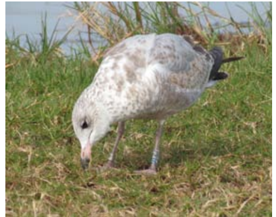
Now Foraging in Florida

This huge endeavor was a success because of all the support we received from donors, volunteers, Environment Canada and UQAM. Something really wonderful did come out of this dire situation. Le Nichoir recruited many new volunteers and established new professional contacts with biologists and government officials and over the long term new contacts will be beneficial to the birds we care for.