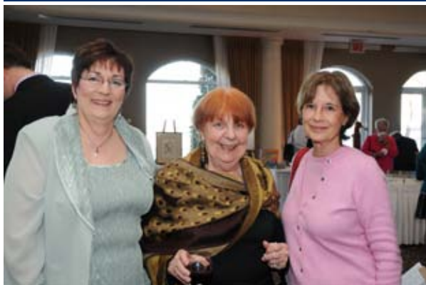
Le Nichoir's Co-Founders