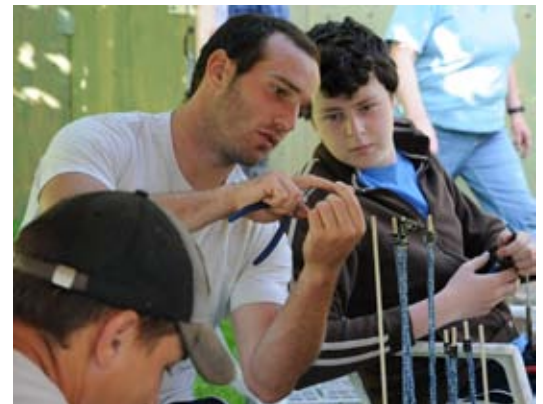
UQAM Banding Team

patterns. Numbered-colored bands were also put on the birds for observational purposes.