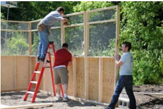
Volunteers Building the New Aviary

The gull situation attracted much needed media to the Centre from local newspapers, and the CBC news and radio which helped spread the word that we were in need of immediate help. Once the general public was made aware of our gull situation, we received an overwhelming amount of support. Individuals from all over immediately visited the Centre to drop off donations including bags and boxes of frozen fish. Local merchants and companies generously donated caging and food.